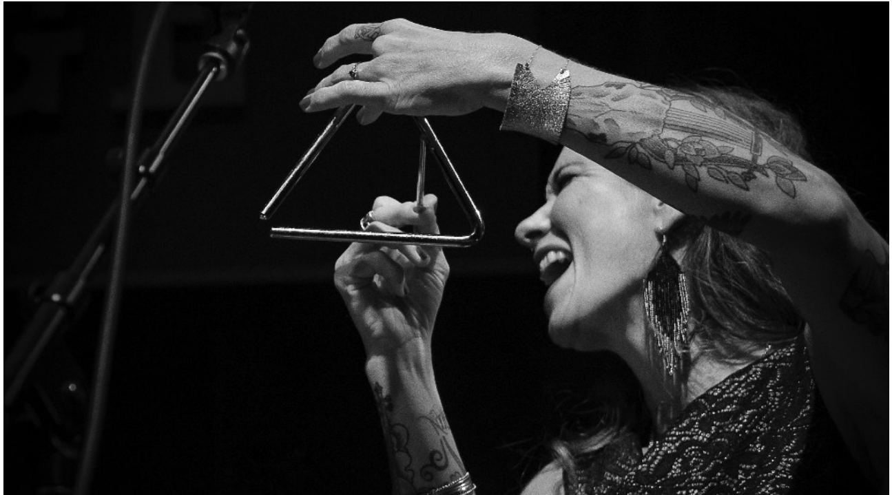
Freight & Salvage, Berkeley CA