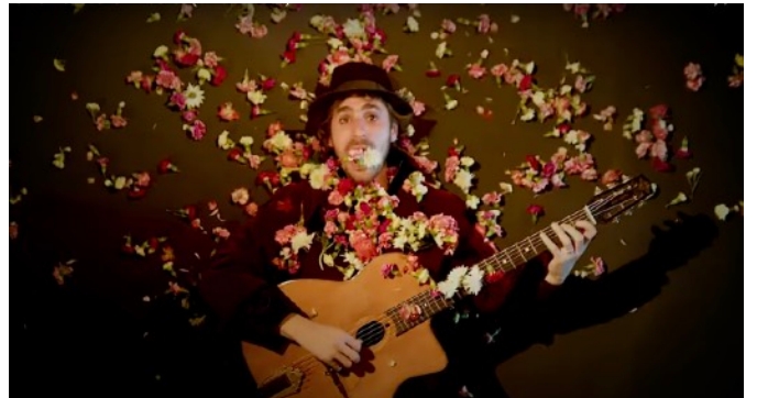
El Joven (Official Video)