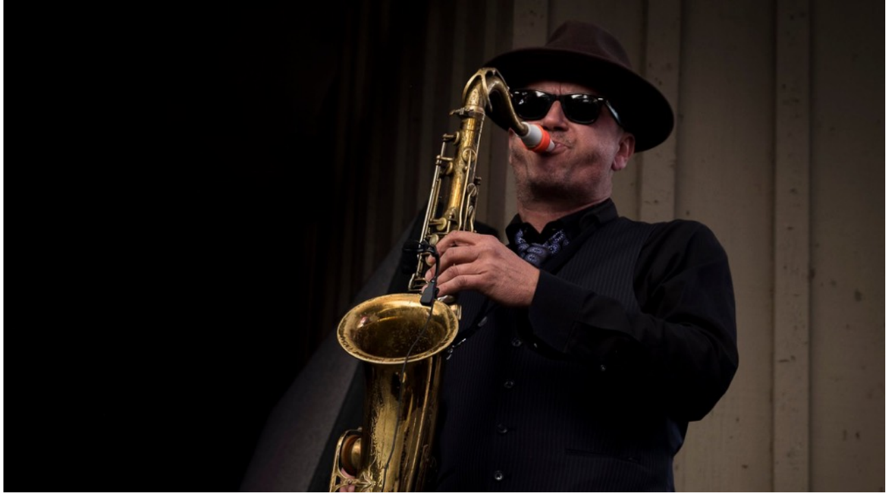
Monterey Jazz Festival, Monterey CA