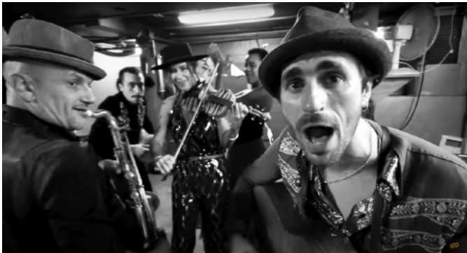
Despierta (Official Video)